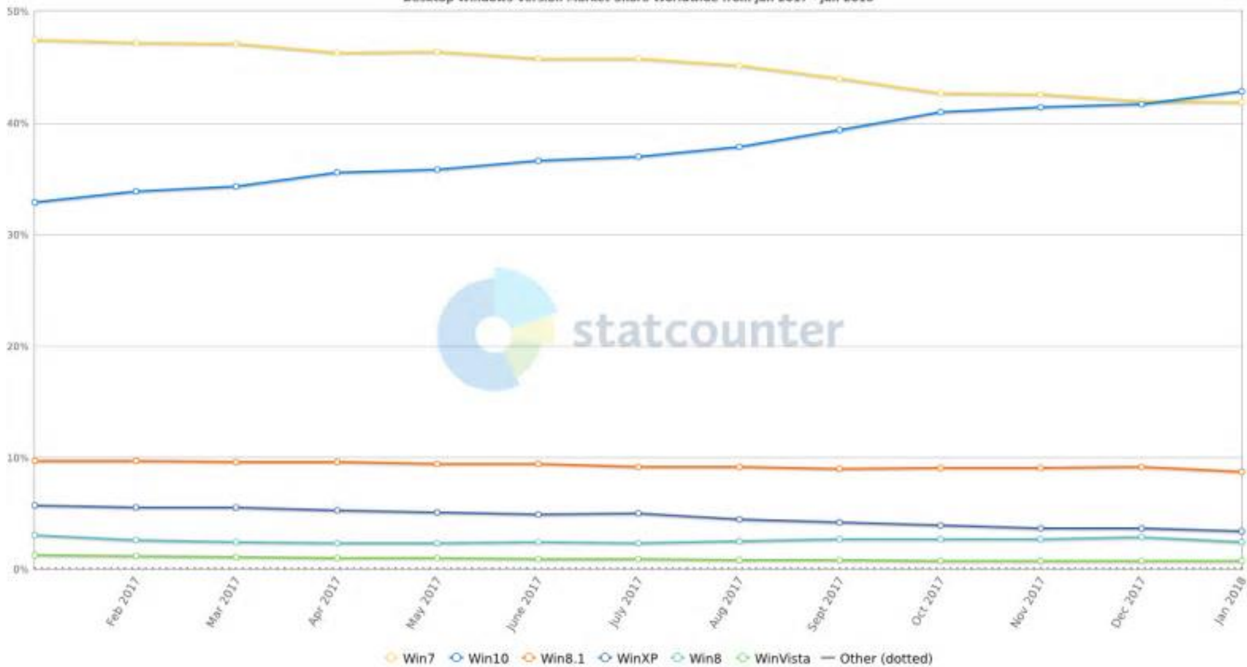
StatCounter Global Stats Desktop Windows Version Market Share Worldwide from Jan 2017 - Jan 2018